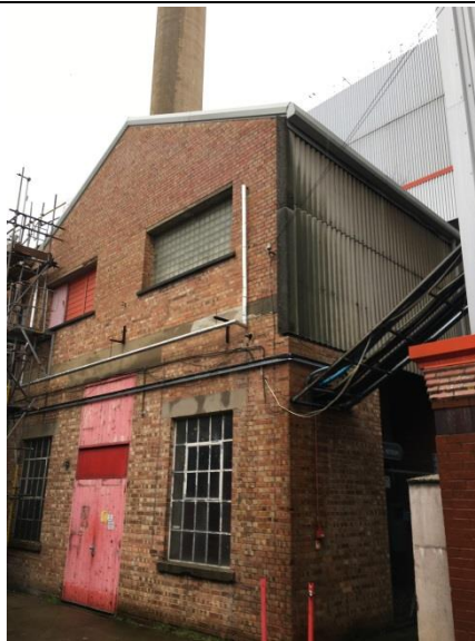
Photograph 4: B26 with corrugated asbestos sheeting providing crevices (potentially suitable roost features).