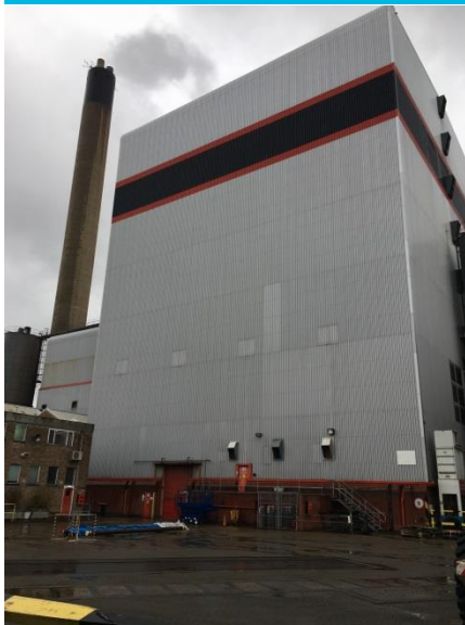
Photograph 1: View of the large buildings within the Site showing metal panel construction and lack of potential roost features for bats.