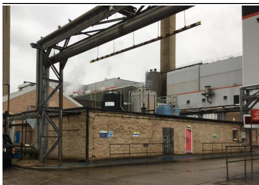
Photograph 7: Eastern elevation of B15. Bargeboard present along flat roof edge with lifted sections suitable for roosting bats –more extensive than B10.