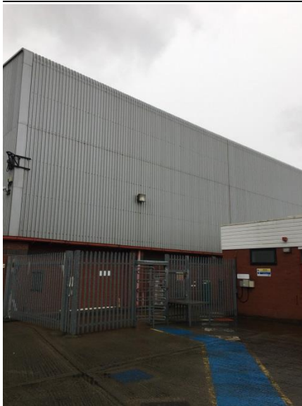
Photograph 3: Southern view of B13 showing general lack of suitability for bats.