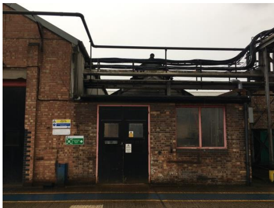
Photograph 5: Building 18 showing wooden pitched roof section (obscured by piping) as an example potential roost feature within the Site.