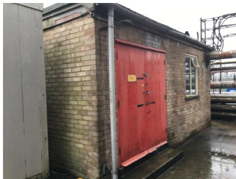
Photograph 6: B10 with very minor gaps under bargeboard however inspected and assessed overall (considering inspection result, minor feature and lack of habitat connectivity) as being of negligible suitability for roosting bats