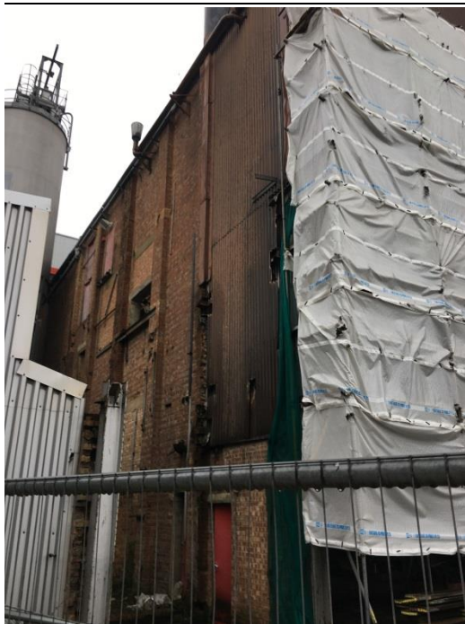
Photograph 9: Building 30 undergoing works with multiple holes and exposed walls creating a draughty and unsuitable interior.