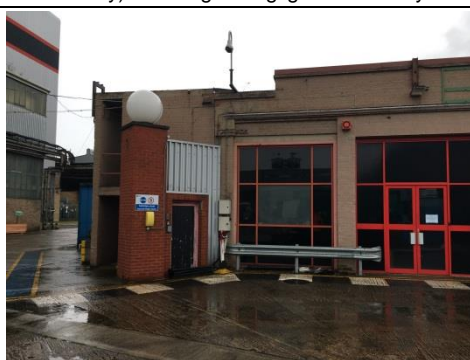
Photograph 8: Western elevation of B22 showing general lack of roost features across building (no soffits, bargeboard, missing brick work etc).