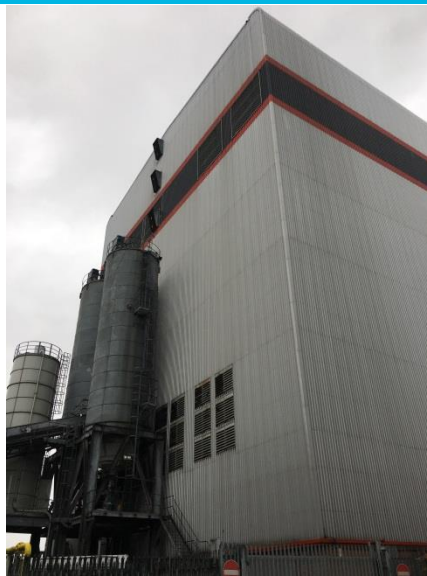
Photograph 2: View of Boiler Building (B12) from Edinburgh Avenue