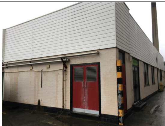
Photograph 10: B8 showing general lack of roost features – cladding tight and securely fitted.